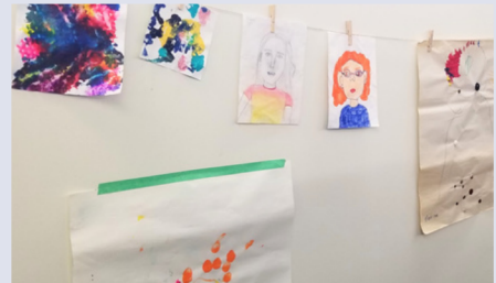
Kids Art Show Gala 2023